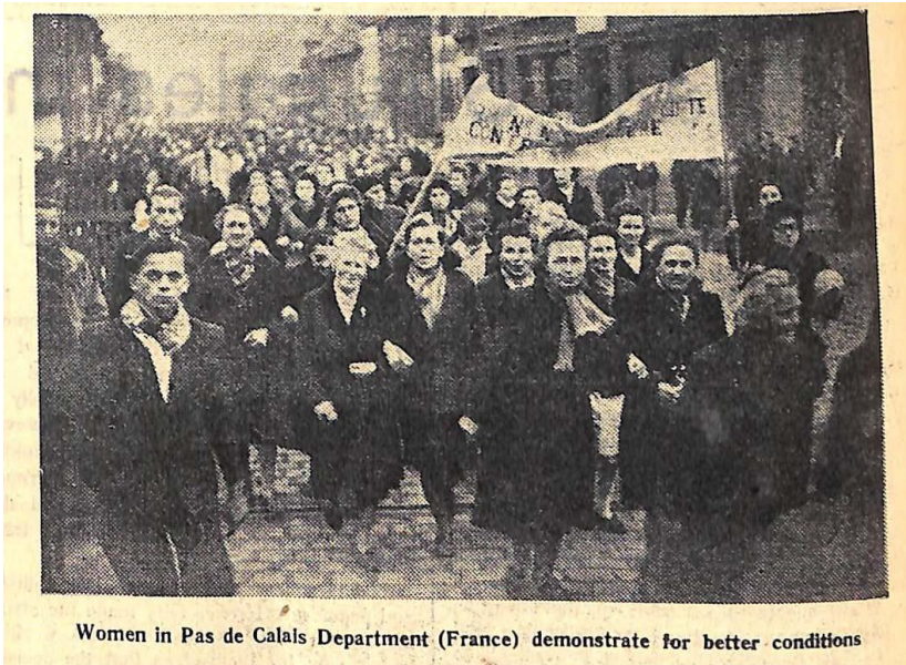
Women in Pas de Calais Department (France) demonstrate for better conditions

Women in Pas de Calais Department. (France) demonstrate for better conditions.